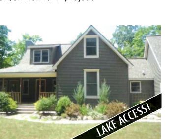
8835 BRANDONHEAD LANE, ELLSWORTH

This home is in great shape and has a full finished basement. A 60 x 20 pole barn just needs a few finishing touches to give you that additional storage you have been looking for! A wood fireplace compliments the family room. Country living, yet near town! Call for your tour today! MLS 435226. Ask for Jennifer Burr. $79,900