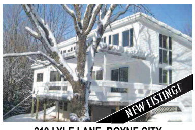
219 LYLE LANE, BOYNE CITY

Very well maintained mobile home with two large stick built additions. This living room has enough room for all! In addition there is a 30 x 30 detached garage and a 30 x 30 pole building all on 13 acres plus to roam! close to the snowmobile trails, not far from Lake Patricia! MLS 434955. Ask for Jennifer Burr. $67,900