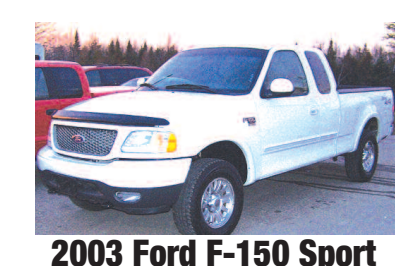
4x4, Supercab. As low as $249 month