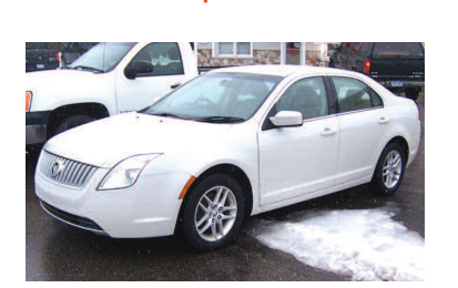
2010 Mercury Milan Air, cruise, power, keyless entry, security system. As low as $199 a month