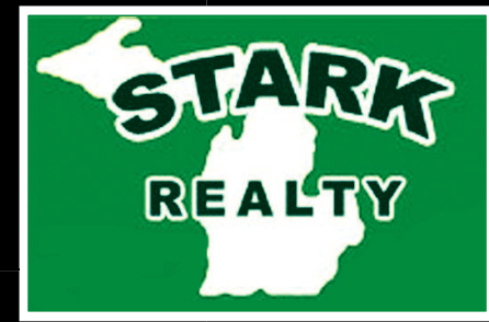
WHERE BUYERS & SELLERS MEET!