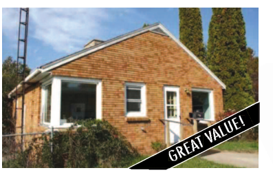
4310 U.S. 131 HIGHWAY, PETOSKEY

Unique two bedroom home sitting on a tranquil four acres of land with some views of Lake Charlevoix. Home offers an attached and detached garage. Call today to schedule a showing! MLS 436043. Ask for Mike Stark. $89,900