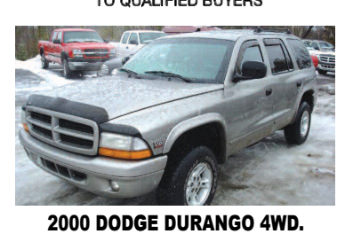
Air, cruise, powerful 8 cyl. PRICED TO SELL